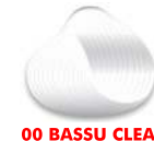
00 BASSU CLEAR