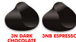
3N DARK CHOCOLATE 3NB ESPRESSO